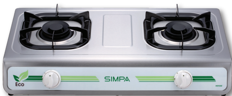
SIMPA WZH2SE 煤氣雙頭座枱煮食爐 Two Burner Gas Hotplate

Let's contribute to environmental protection